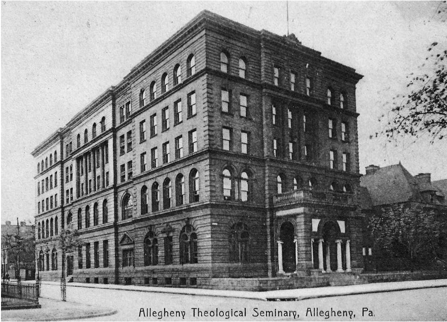
Allegheny Theological Seminary, Allegheny, Pa.

How Allegheny became a center for Presbyterianism