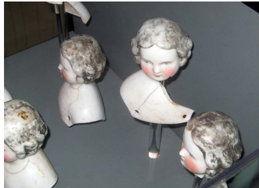
PORCELAIN DOLL HEADS from the site excavation are now on display at the hotel.

above the North Commons of the City of Allegheny and was on the board of directors of the House of Refuge. With the help of all these discoveries—over 26,000 items—the PNC Legacy Collection was created. The Fairmont decided this was the unique expression that they wanted to showcase in Pittsburgh. The main lobby floor and the second floor have wonderful display cases highlighting the discovered pieces. The 185-room hotel has artifacts featured on every guest room floor which we got to see on this private tour. The spectacular view from the 23rd floor of the Fairmont was an add-on benefit. Ms Davis joined us for lunch at the Habitat restaurant at the completion of the tour.