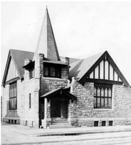
North Side Unitarian Church 1910

His local work includes commercial buildings, high schools, churches, hospitals, and residences. He produced numerous institutional buildings in Western Pennsylvania, Alabama, Kentucky, North Carolina, and Tennessee. He had something of a national, indeed, international reputation. He served on the Committee on Design of President Hoover's Housing Conference and designed a series of United States foreign consulates in, among other places, Shanghai, China and Calcutta, India. Trimble wrote frequently for The Charette , the journal of the Pittsburgh Architectural Club. Autobiographical articles appeared in The Charette in 1936 and 1938.