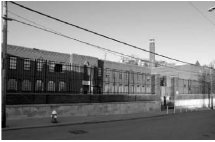
Schiller School of 1939