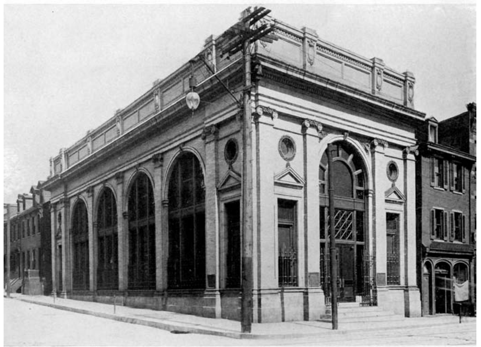
Workingman's Savings Bank 1902