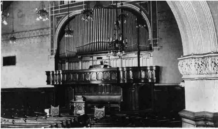
INTERIOR of the First Presbyterian Church of Allegheny, from the records of the Estey Organ Company

ship site. After World War II the exodus of families to the suburbs began in earnest, greatly affecting the viability of First Presbyterian Church of Allegheny. The planners for the great renaissance of the North Side, The New Allegheny Center, needed the church's property. The site became part of a 2.5-acre tract of land known as Allegheny Towne Community (and now known as Foster Square) that was adjacent to the redevelopment area. The few church members remaining found other locations to worship and the ivy covered church on Arch Street was no more.