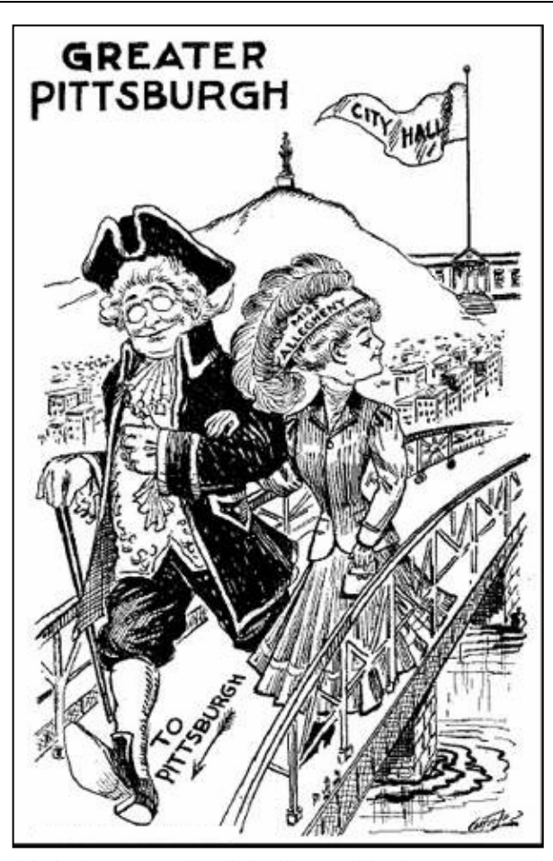
This is the postcard (originally a political cartoon, published in 1907) that depicted Pa Pitt escorting Miss Allegheny across the river.

On April 13, 1840, the Borough of Allegheny (formed April 14, 1828) was incorporated as Allegheny City. As we all know, Allegheny City, which had became the third largest city in the Commonwealth, ceased to exist as a separate city on December 7, 1907 when it was annexed by the City of Pittsburgh (over the objections of many Allegheny citizens). The election that decided the annexation was set up so the majority of the combined vote in both cities would determine the outcome. Although the majority of the voters in Allegheny opposed it, the majority of the voters in Pittsburgh wanted it. Pittsburgh had a population of about 350,000 in 1907 and Allegheny had a population of about 150,000. We didn't have a chance!