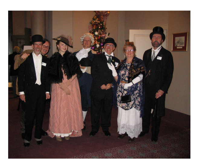
Some costumed Guests