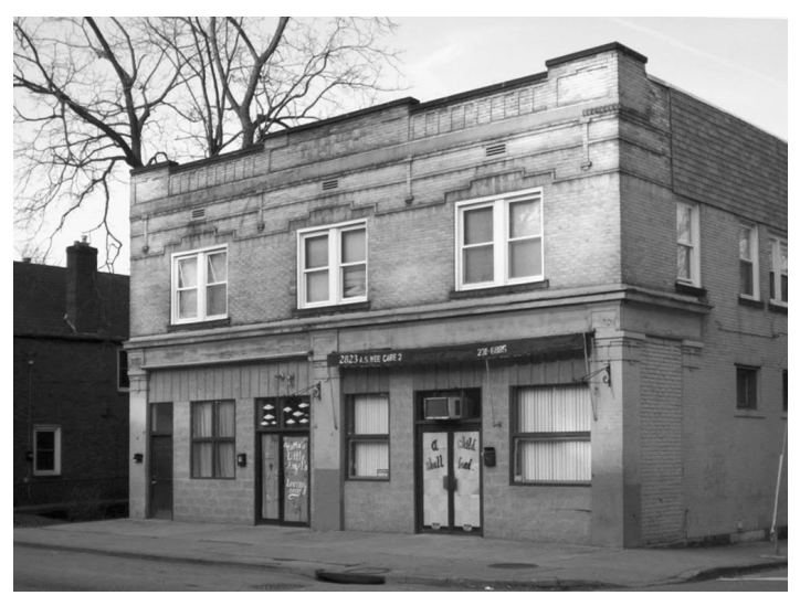
2823 Perrysville Avenue today

as production manager for Reymers. That was twice the salary received by the head of the company! Who would have guessed that our favorite refreshment was so profitable and that the drink itself is the only remaining evidence of what was once a name associated with all things sweet in Pittsburgh—Reymer's!