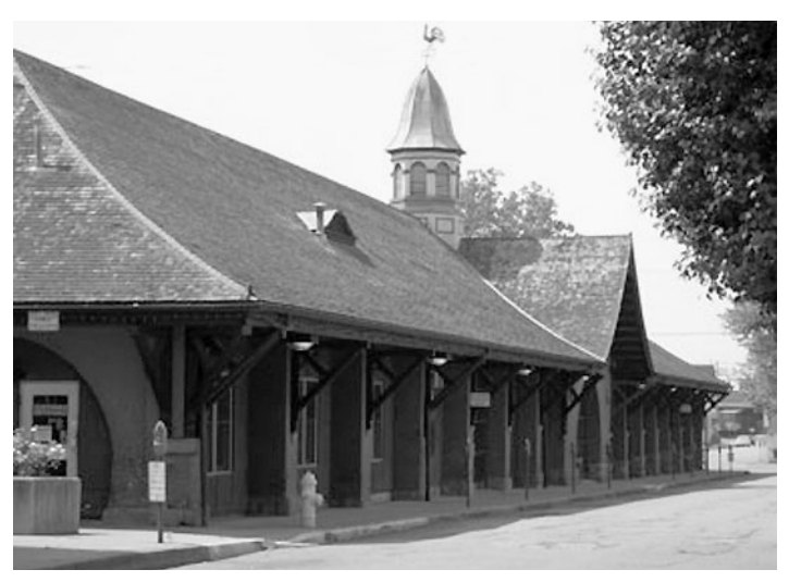
Wheeling Centre Market

Tour the renovated courtroom at the Independence Hall Museum where the Restored State of Virginia met and later the legislature of the new state of Western Virginia. See the first capital of the state and the Centre Market built in the 1850s where slaves were bought and sold.