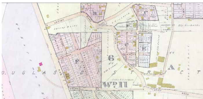
LAPISH ROAD AREA in Allegheny City's Eleventh Ward, c1902