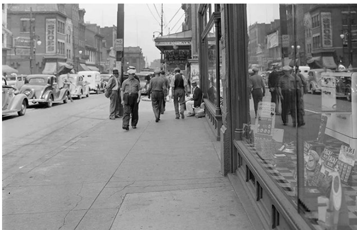
The Gould Theatre at 719–723 East Ohio Street

of East Ohio Street as the Gould, but closer to the intersection of East Ohio & Chestnut Streets. During the 1940s, the Arcadia was another of the home-owned & home-operated independent Naborhood theatres. Rodan! The Flying Monster & Rally 'Round the Flag, Boys! starring Paul Newman and Joanne Woodward were amongst the strange double features that played at the Arcadia in its declining years. The theatre closed in the late 1950s.