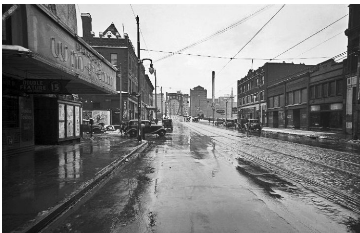
Wm. Penn Theatre on Federal Street looking south toward the river

In the northwest block of Federal & Lacock Streets, sitting below the Pittsburgh, Ft. Wayne & Chicago Railroad Bridge was the Elite Theatre at 309 Federal. This nickelodeon featured silent films such as 1921's The Bridal Night starring Alice Brady. As a boy, I recall walking to Downtown Pittsburgh via Federal Street from my home on the Spring Hill and passing by Elite Furniture with its "We Buy Anything" slogan painted on the worn façade. The Elite and its neighboring buildings were demolished and today, traffic passes overhead on the I-279 Parkway North.