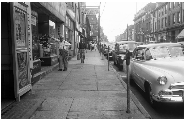
The Arcadia Theatre at 823 East Ohio Street

The G. C. Murphy's that replaced the Gould along with its neighbors, the Arcadia and Century-Family, became victims of the East Street Valley redevelopment. The concrete and steel of I-579 and the Veteran's Bridge along with littered grassy knolls now stand in their place along East Ohio Street. Redevelopment in the East Ohio/Federal Street corridor and the construction of Allegheny Center in the 1960s dimmed the projectors there also. Only the façade and outer lobby of the North Side's most famous/infamous theatre, the Garden, still remain. Sad to say, but going to the movies on the North Side of Pittsburgh is truly ... gone with the wind.