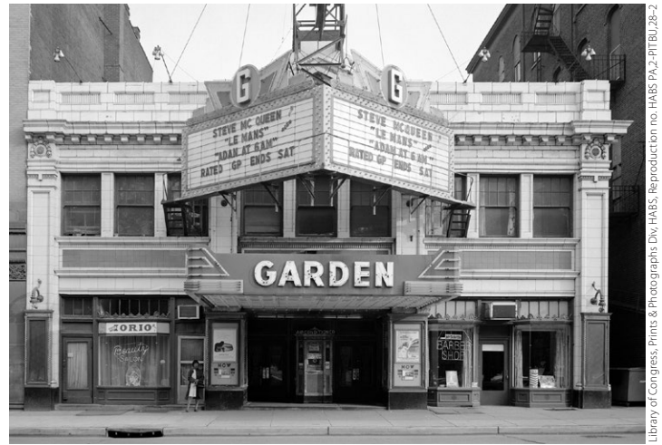
Garden Theater September 1971, West North Avenue near Federal Street

Folks who might be interested in the Gandy’s project, your support for the Allegheny City Gallery, your recollections of times past, and your images of the “old north side” are welcome at «blackgeminis5@netscape.net».